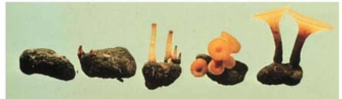
When sclerotia eventually germinate, they release spores that can infect the soybean crop in the field.

The 2010 Corn Hybrid-Herbicide Management Guide is included with this newsletter. This management guide has been developed through the efforts of several different teams within Pioneer. These guides have been compiled by using data collected from replicated trials from multiple locations across the United States over a period of years. Field observations by Pioneer agronomists are also factored into the rating of each hybrid. This information should be used in managing herbicides to minimize crop response from a given herbicide family and hybrid combination.