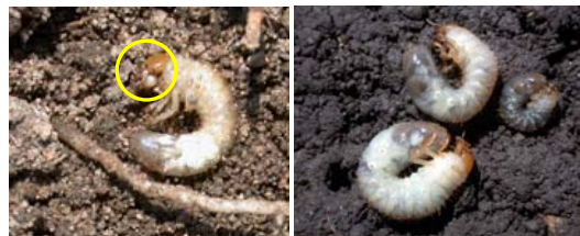
AGB grub with enlarged palps White grub with small palps Images from Purdue University.

Not all white grubs are the same. Asiatic garden beetle (AGB) grub is a pest that continues to expand in northern Indiana. AGB grubs are more voracious feeders than Indiana's more common white grub species and cause significantly more crop damage. Growers with a known AGB problem should be planting corn treated with Poncho ® 1250 insecticide. AGB grubs are smaller than other white grub species and will have a small white pouch (palps) next to their mouth.